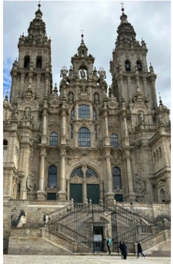
Cathedral at Santiago de Compostela

We next spent three nights in Santiago De Compostela. Wow!