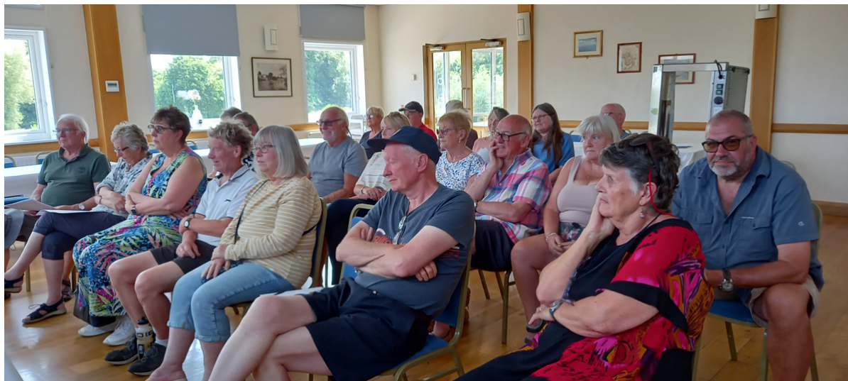
Spellbound members at our AGM