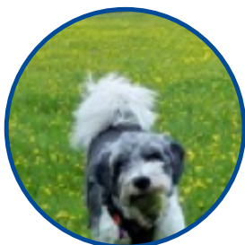
Hobby Hound Molly is on our page 6