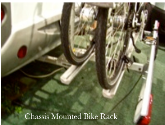
Chassis Mounted Bike Rack

Hobby Pedelec A Hobby electric bicycle (produced by Wondervelo). A touring style bicycle with Aluminium frame and forks, with springing to front forks and seat post, 7 gears, 3 brakes (2 hand brakes, pedal backwards for 3rd). Total weight 25kg. Electric front wheel drive with up to 250 watts of power with a 36v 10ah battery with a charge time of 4 to 6 hours giving an approximate range of 90km. Yours for €1499.