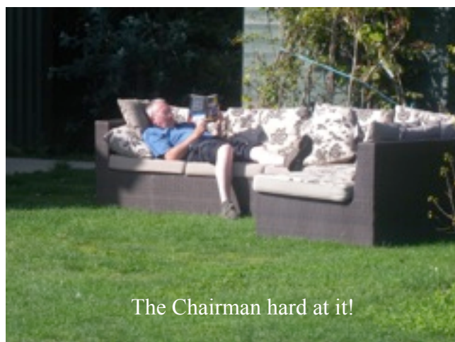
The Chairman hard at it!