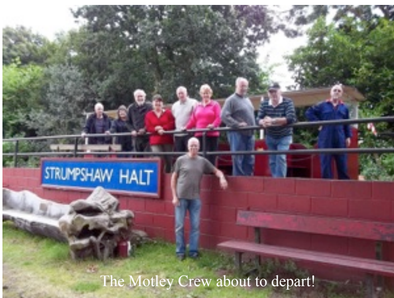
The Motley Crew about to depart!

ploughing equipment, these huge things looked highly dangerous. The on site miniature railway was then pulled out and we all enjoyed a 15 minute ride around the estate aboard Jimmy, accompanied by Gerry's Jack Russell riding bravely on the footplate.