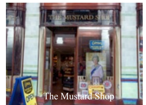
The Mustard Shop