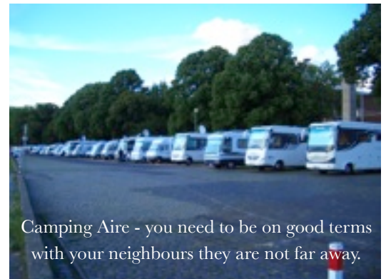
Camping Aire - you need to be on good terms with your neighbours they are not far away.