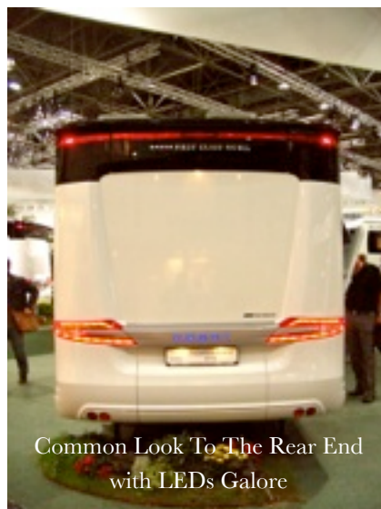
Common Look To The Rear End with LEDs Galore

and on the rear external view and looked quite attractive. Based on the German literature the Hobby range now comprises: Premium Van (5 Models), Premium Drive (10 Models) and Siesta (2 Models). I must admit to not understanding the logic used to number the various models it being a number