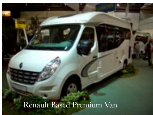
Renault Based Premium Van