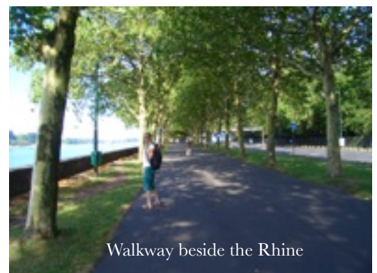
Walkway beside the Rhine