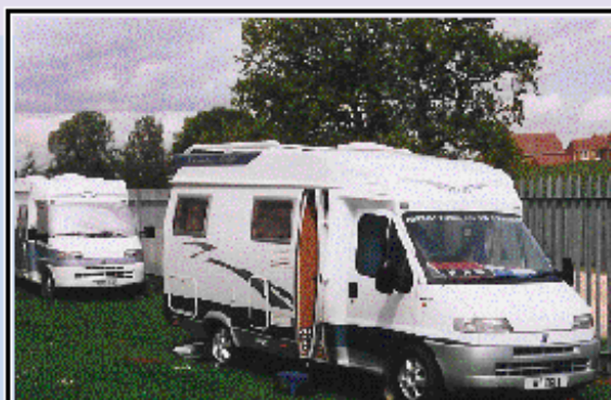
The full MMM editorial complement at the 2002 Peterborough show

We are away to Lytham St. Anne's this weekend; three adults (and mother-in-law came too) and two dogs in a 600? Must be masochists!!